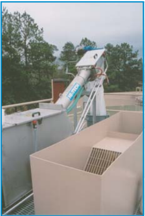
Model HTSC-E (Modular)