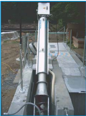
Model HTSC (In Channel)

Hi-Tech Environmental, Inc. offers a complete line of in channel and self contained modular screening systems. Standard models include HTS, HTS-E, HTSC and HTSC-E . Each unit utilizes a perforated plate or v-wire screen section to effectively remove unwanted solids and debris from the influent. The screenings are transported via a shaftless conveyor to the compaction and washing zone, where they are cleaned, dewatered then finally discharged into a receptacle or optional bagging system. Hi-Tech custom designs each screening system according to the project requirements.